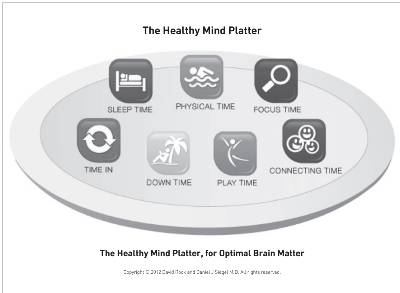
Figure 1: Ingredients of the Healthy Mind Platter.

Now consider how different things could be. What would happen if we were to start the day after a good night's sleep with half an hour of reflective practice, taking advantage of the rested and centered mind to prioritize the activities of the day? We might consciously plan to take a break over lunch, allowing for down time or even a brief nap, and arrange for a tennis game with a friend right after work, thus combining connecting time and physical activity. When we arrive at work, we mindfully schedule the meetings of the day to alternate individual focus time with meetings with colleagues so as to have a day with variation in brain activity. The result might be that when we come back home we actually have sufficient reserves to connect and play with our children, completing the list of healthy activities for the day before dinner time. Following a healthy mind diet can provide us with the physical and mental well-being necessary to establish and maintain relationships with family, friends and colleagues, and efficiently realize the tasks and responsibilities at school, work, and in our communities.